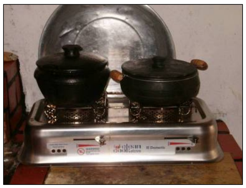
Black stone pots are quarried and crafted in Minas Gerais. They are preferred especially for cooking beans and soups, as they keep the contents hot long after being removed from the stove.