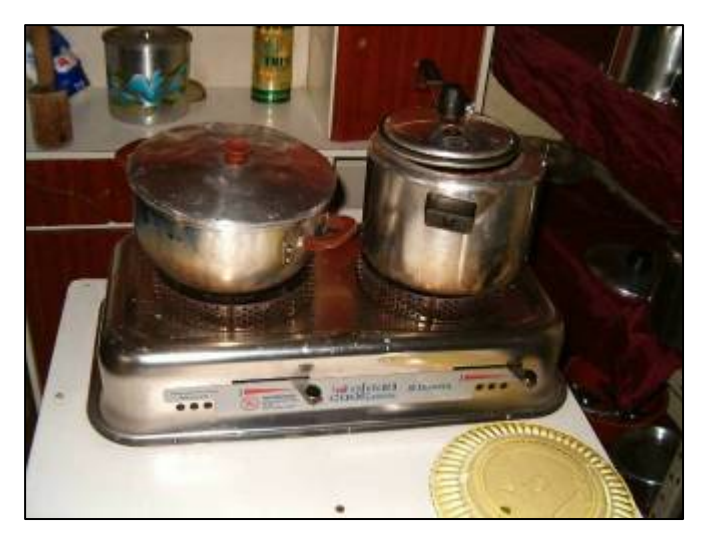
The pressure cooker on the right was a standard pot in all of the homes we visited. It is used mostly for beans and occasionally for beef. A pot of beans cooks in 45 minutes on the CleanCook, whereas the same pot of beans on an LPG stove takes an hour to cook.

We had lunch in Betim, and then drove 3 hours to the Urucania - Usina de Jatiboca near the town of Ponte Nova, the final pilot study site to be visited on the trip.